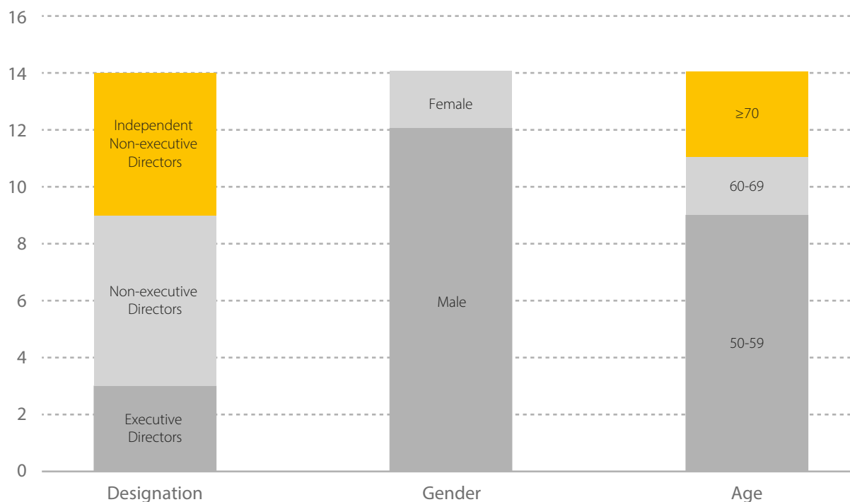
Number of Directors

The board is comprised of experienced senior management from varied backgrounds, accounting, banking and tax professionals. Nationalities of the directors are diverse, spanning Chinese, American and Japanese. Such composition serves to enrich the perspective and deliberations of the board.