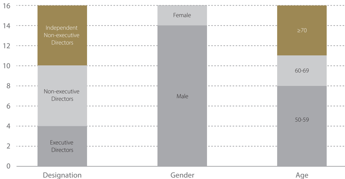
Number of Directors

The following chart shows the diversity profile of the current board members: